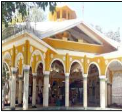
Bala Hanuman Temple