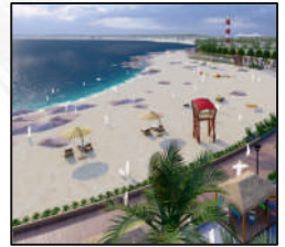
Shivrajpur Beach (139 km)