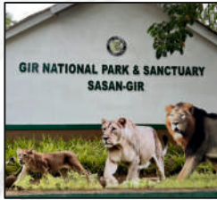
Sasan-Gir (168 km)