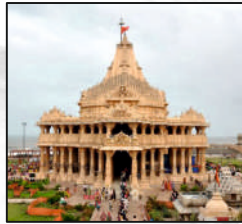
Somnath Temple (215 km)