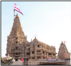
Dwarkadhish Temple (132 km)